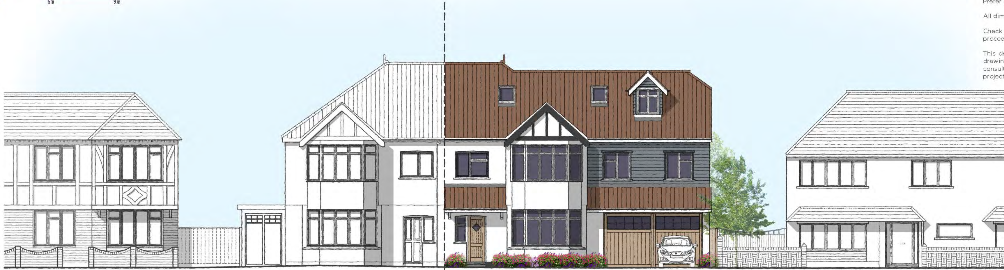
RESIDENTIAL PROPERTY: 89 WESTERN ROAD, LEIGH-ON-SEA